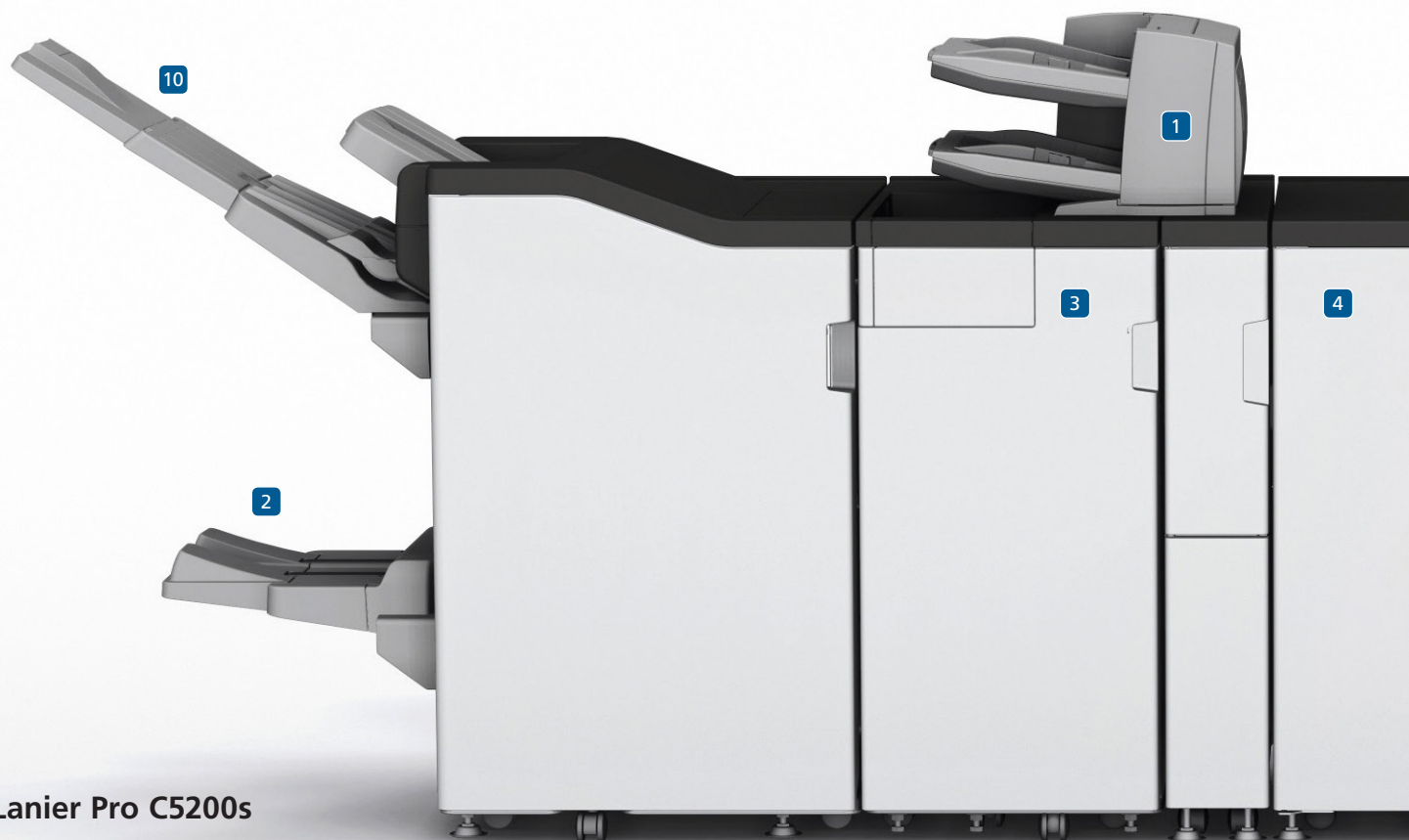
Lanier Pro C5200s