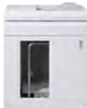
High Capacity Stacker (Single or Dual) up to 5,000 Sheet Removable Cart (Top Tray 500 Sheets)

Create professionally bound documents in-house by combining printing, punching and collating in one convenient step. Ideal for punched applications such as manuals, guides and planners.