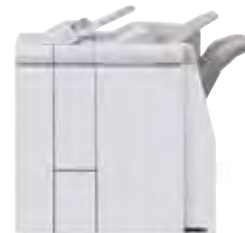
Standard Finisher with Optional C-Z Folder (2-100 sheets, 3-position variable length stapler)

Your choice for long production runs, removable carts make it easy to unload your large jobs. Dual stackers support unload-while-run capability so you can be even more productive.