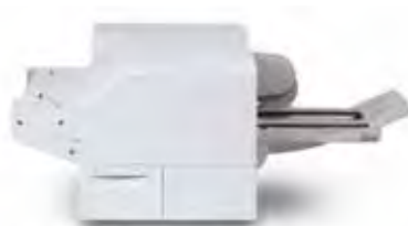
Xerox® SquareFold® Trimmer Attaches to the optional Booklet Maker Finisher

Incorporating all of the features of the Standard Finisher, plus booklet-making capabilities. Ideal for large booklets and calendars, up to 25 sheets with 100 imposed pages, 100 imaged sides. Excellent handling of approved coated stocks along with saddle-stitch and bi-fold capabilities.