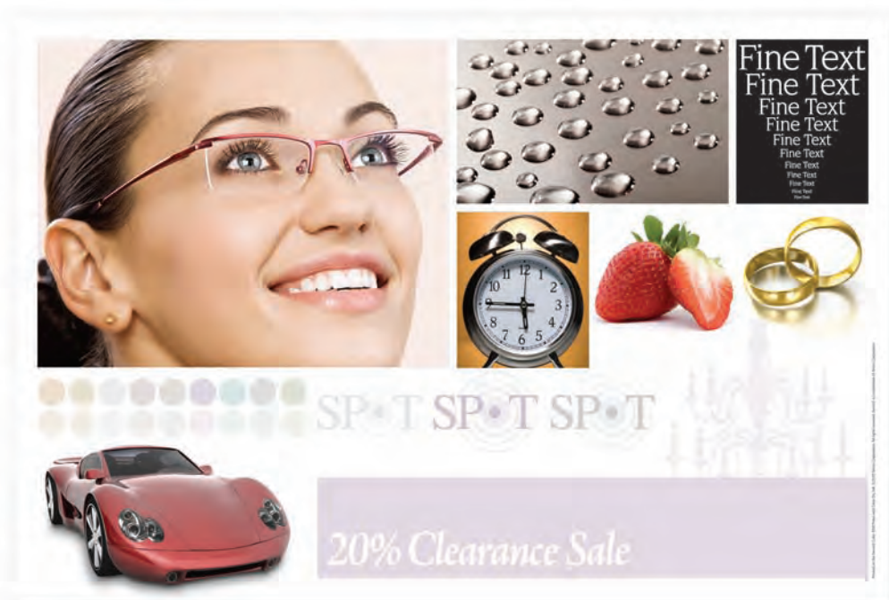
Base image without clear dry ink areas.

The creative options you can offer by adding this new, clear dry ink capability can help you become a true partner to your customers. You can advise customers already expert in design and layout on how to set up their files properly for this additional clear layer to achieve their desired effect. Or you can offer creative value to customers when they deliver their files, by adding some of these effects right at your print server.