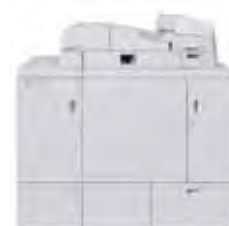
Xerox® Perfect Binder*

Enhance your professional finishing even further with creased cover sheets, face trimming and control of trim and square fold thickness. Create crisp, sharp square spine booklets that can be opened flat and are easy to handle, stack and store.