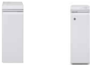
Interface Module (required to support finishing modules) [Left]