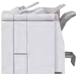
Booklet Maker Finisher with Optional C-Z Folder (25 sheets or 100 page booklets)

Enhance your standard finishing applications with convenience and flexibility. Variable length stapling for up to 100 sheets delivers neat output, regardless of your document size. Hole-punching saves time and money, while the optional folder enables you to create applications featuring bi-fold, C-, Z- and Engineering Z-folding.