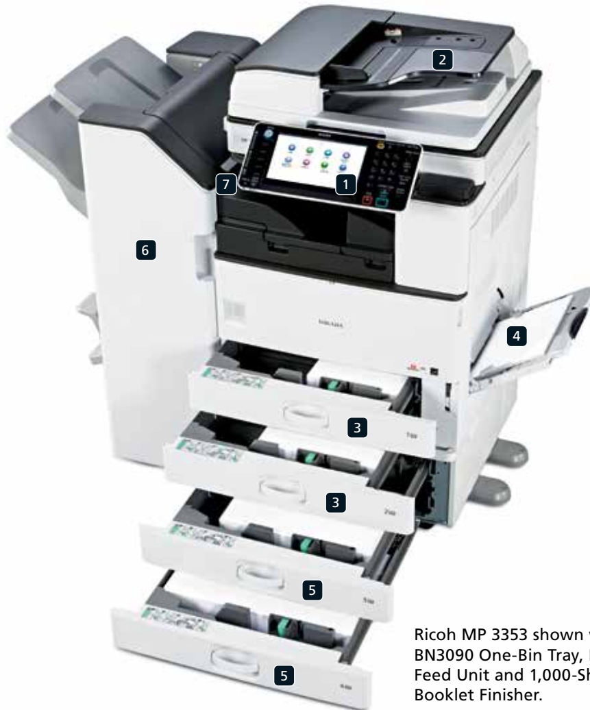
Ricoh MP 3353 shown with optional BN3090 One-Bin Tray, PB3180 Paper Feed Unit and 1,000-Sheet SR3150 Booklet Finisher.