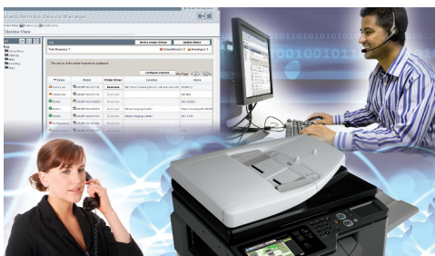
Sharp Remote Device Management