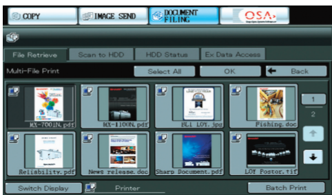
Sharp's easy-to-use Document Filing System with thumbnail preview