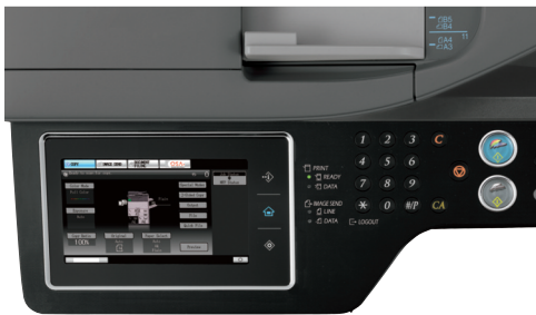
High-resolution touch screen with Stylus pen for easy point-and-touch operation