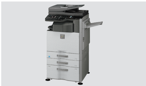
Available paper capacity stores up to a maximum of 3,100 sheets with options