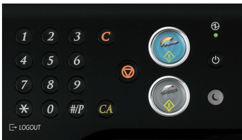
Separate print buttons for B&W and Color allow users to selectively manage use of color

Managing all of the advanced features of your Sharp product is simple and easy. Ask your Authorized Sharp Dealer about the My Sharp website . This dedicated customer training website is customized to your MX-2615N/MX-3115N and allows you to locate resources and find information specific to your configuration, truly helping you maximize your investment.