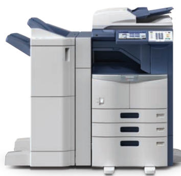
e-STUDIO456 with 2,000-Sheet LCF, Hole Punch, and 50-Sheet Staple Console Finisher.