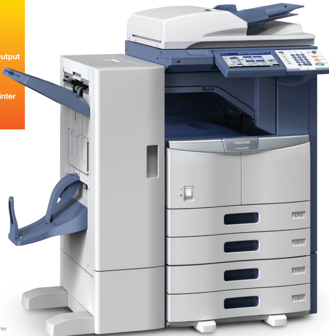
e-STUDIO456 with Saddle-Stitch Finisher