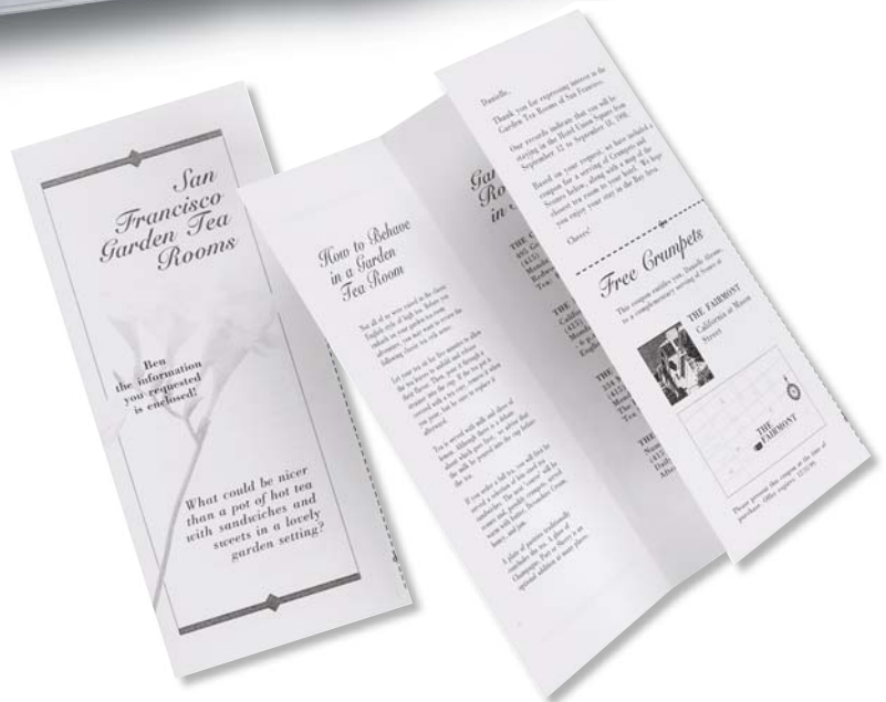
▲ C- or Z-FOLD MAILERS