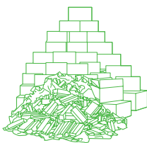
Laser 334 lbs/151 kg

Total waste produced from printing 12,500 pages per month for 4 years.