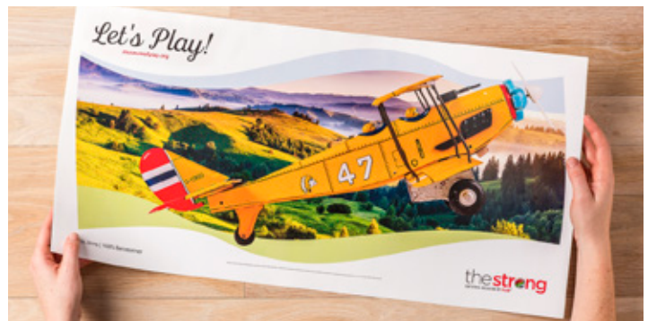
Extra-long sheet printing—maximum paper size 13 x 26" (330 x 660 mm)

It all adds up to better margins, higher profits and the ability to grow strategically with a single, future-proof investment.