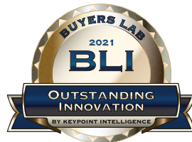
Xerox Adaptive CMYK+ Kits

Take automation to the extreme with click-simple automated color quality with full spectrum color management hardware and software tools. An inline X-Rite® Spectrophotometer with Color Profiler Suite working with Automated Color Quality Suite (ACQS) takes the variability out of the color equation and reduces time-consuming manual color maintenance and operator error.